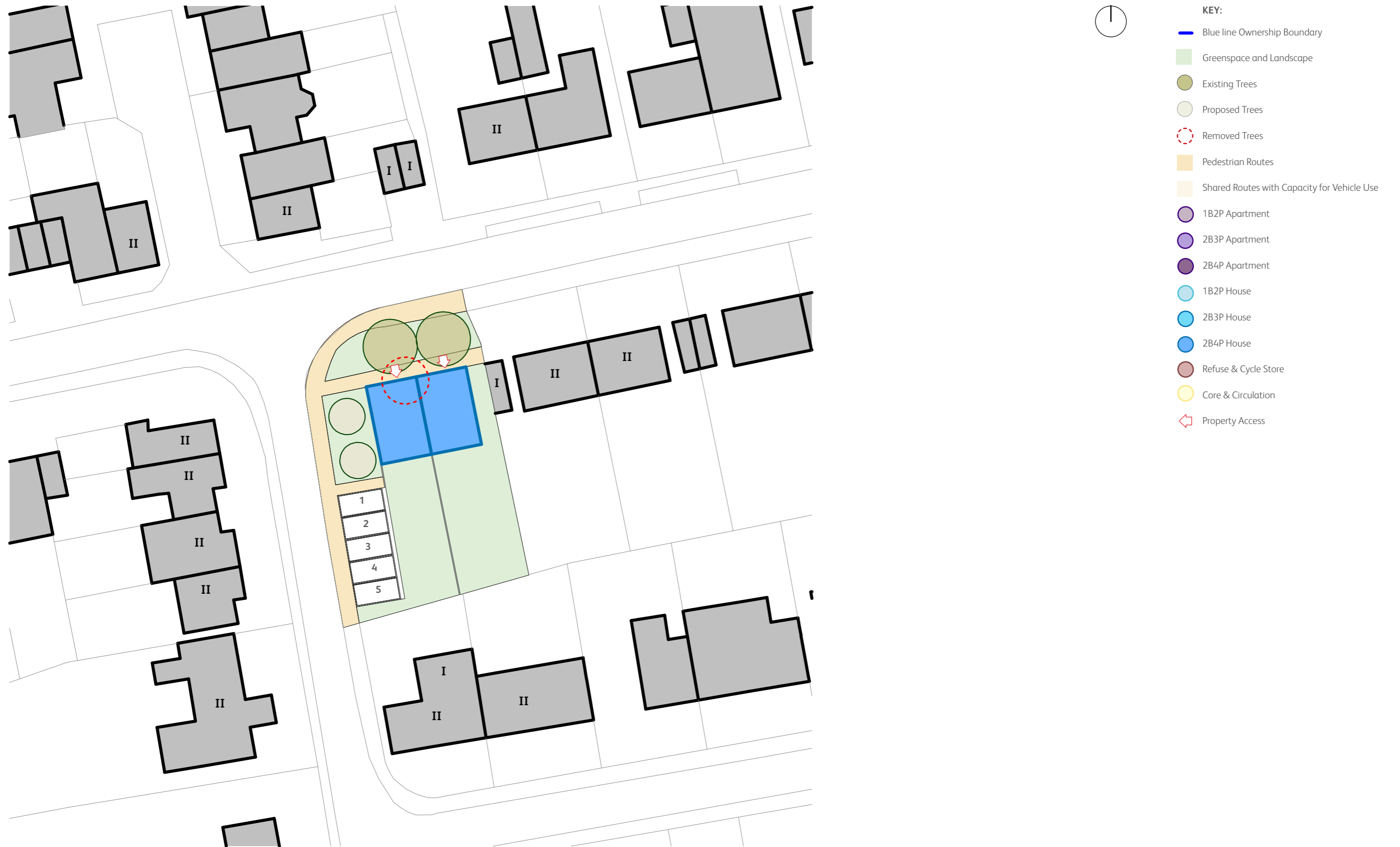
Figure 2 - Proposed Ground Floor Plan